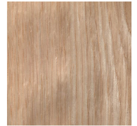
American Oak (Light)